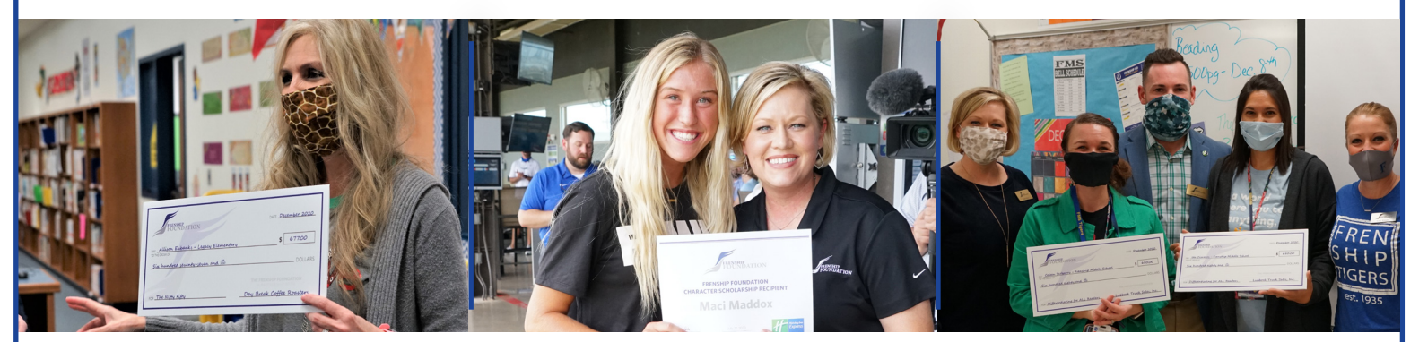
Frenship ISD students and educators who received scholarships and grants in 2020.

GENERAL DONATION: Providing a one-time or reoccurring general donation will help the Foundation continue its mission of serving and giving back to the Frenship community.